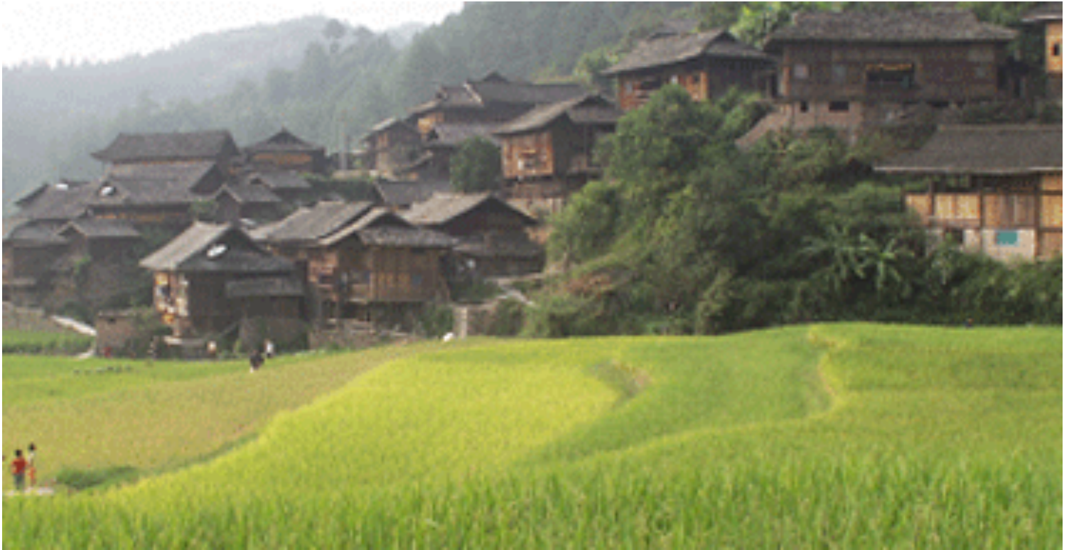
Beautiful scenery and bristling satellite dishes obscure underlying poverty in rural China.

International charities can play a vital role in helping extend the benefits of China's rapid development, says Ken Burnett